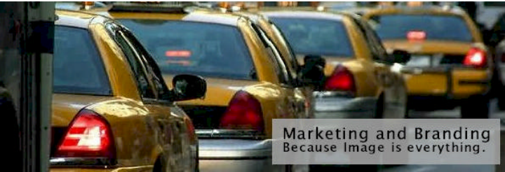
Marketing and Branding Because Image is everything.